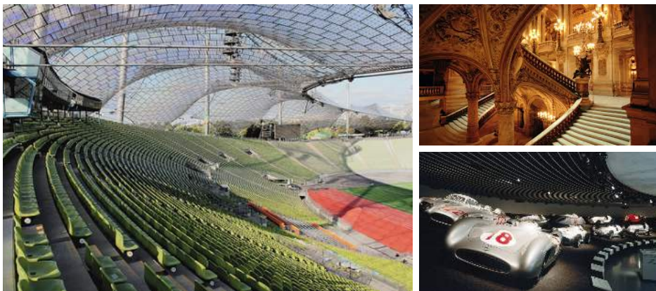
Clockwise from left: 1. Olympic Stadium, Munich 2. Inside Hohenzollern Castle, Stuttgart 3. Mercedes Benz Museum, Stuttgart