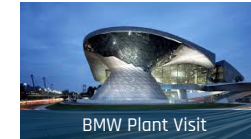
BMW Plant Visit