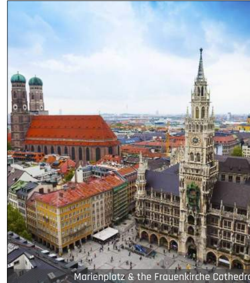
Marienplatz & the Frauenkirche Cathedral