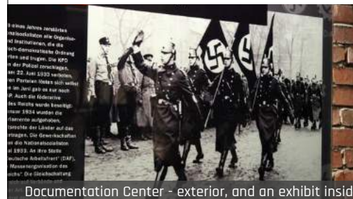
Documentation Center - exterior, and an exhibit inside