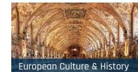
European Culture & History