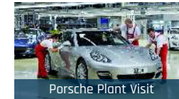
Porsche Plant Visit