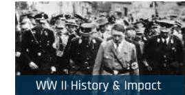
WW II History & Impact