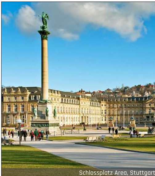
Schlossplatz Area, Stuttgart