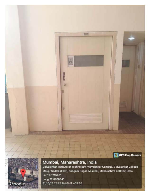
Figure 2.1. Disabled Friendly Washrooms, VIT