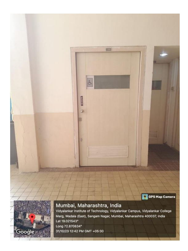
Figure 3.1. Signage boards on Washrooms, VIT