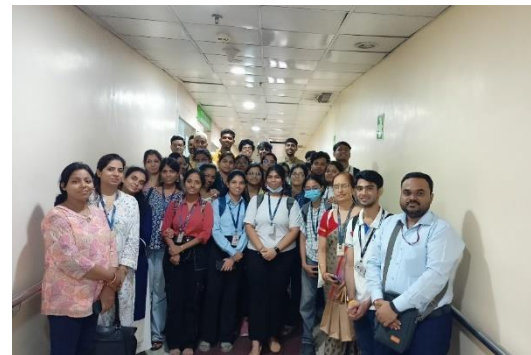
Student, Teachers & Experts at Tata Memorial Centre